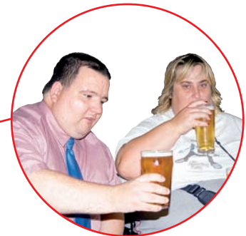
Meeting with friends