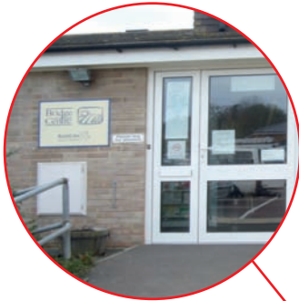
The Bridge Centre