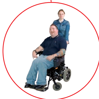
Private and voluntary service providers