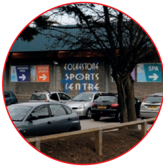
Folkestone Sports Centre